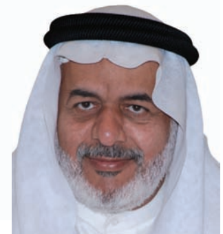
Khalifa Mohammed AL Hotti

Al Hotti concluded by saying: ( The path to excellence had rejuvenated itself and is not limited by any boundaries. It is with determination and willingness that Nations are built and achieve renowned status.)